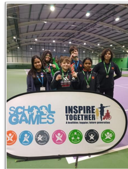
Boccia trophy winners 2025