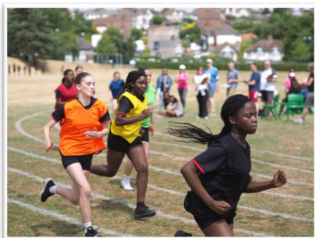
Annual Sports Day at English Martyrs'