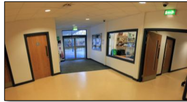
Entrance to St Sebastian Sports Centre

At English Martyrs' all of our students are provided with the opportunity to learn new and develop existing skills in a range of sports using our state-of-the-art facilities.