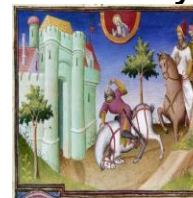
The Conversion of Saint Paul