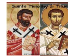
Saint Timothy and Titus